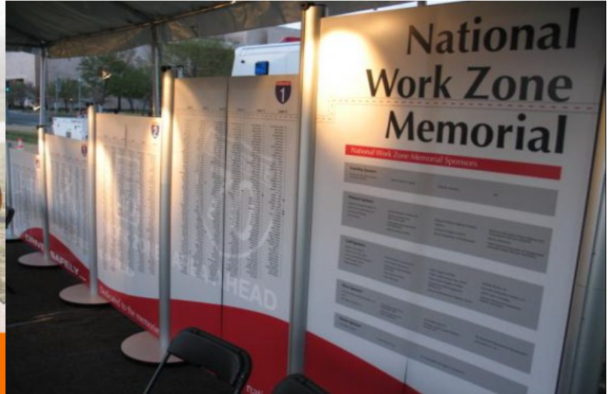
Travelling Memorial Display Honors Those Who Have Been Killed In Work Zone Crashes

National Work Zone Awareness Week (NWZAW) is set for April 15-19, 2013. The national kick-off event will be held at an urban work zone in Washington, DC. The theme this year is "Work Zone Safety: We're All in This Together". This theme emphasizes the importance of thinking beyond the construction crews and drivers.